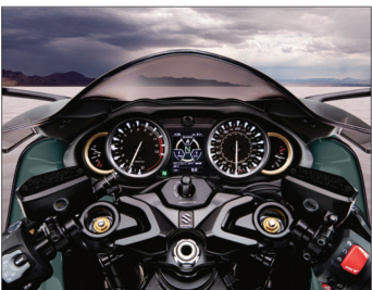
The beauty of fine instrumentation