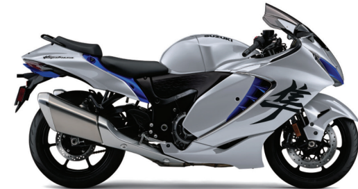
Metallic Mystic Silver / Pearl Vigor Blue (ASU)