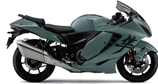
Metallic Mat Steel Green / Glass Sparkle Black (COT)