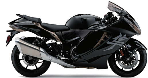
Glass Sparkle Black / Metallic Mat Titanium Silver (BLG)