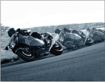
Suzuki Intelligent Ride System (S.I.R.S.)

Developed for the Hayabusa, the unique and strong RK GB50GSVZ4 drive chain has larger pins and rollers for reliable and quiet operation.