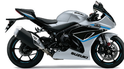
Metallic Mat Sword Silver (QKA)