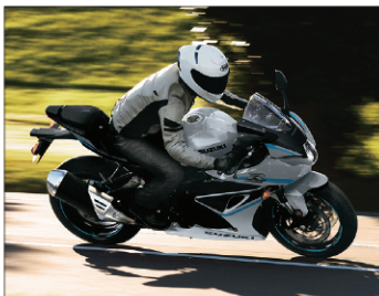
Suzuki Intelligent Ride System (S.I.R.S.)