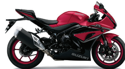
Candy Daring Red / Glass Sparkle Black (AV4)