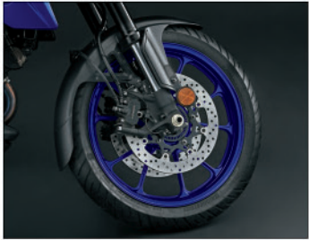
19-inch Cast Aluminium Front Wheel