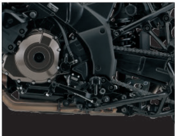
Bi-directional Quick Shift