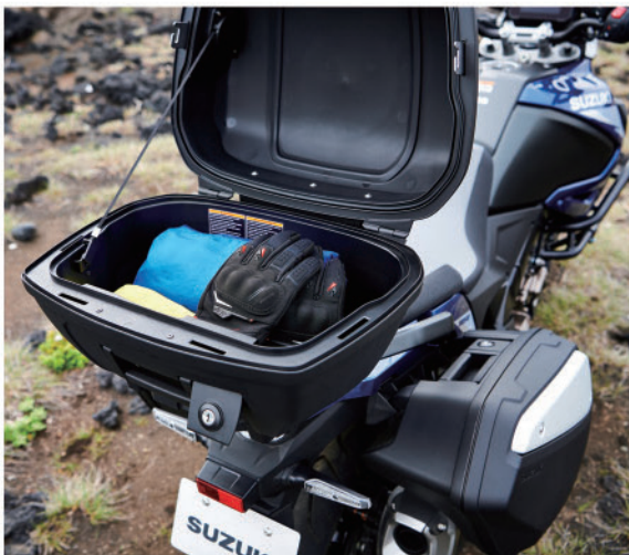
* This photo includes optional accessories.

Note: SUZUKI MOTOR CORPORATION reserves the right to change the design or discontinue any Suzuki Genuine Accessory at any time without notice. Some Suzuki Genuine Accessories might not be compatible with local standards or statutory requirements. Please check with your local AUTHORIZED SUZUKI DEALER for details at the time of ordering.