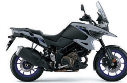
Glass Mat Mechanical Gray / Metallic Mat Black No.2 (CQX)