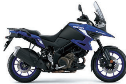
Pearl Vigor Blue / Metallic Mat Black No.2 (CGJ)