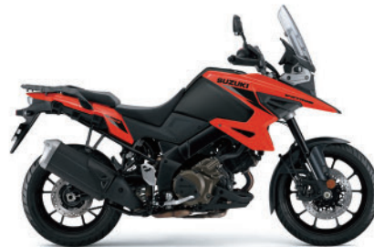
Glass Blaze Orange / Metallic Mat Black No.2 (CGH)