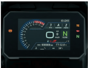
Colour Multi-information Instrument Cluster