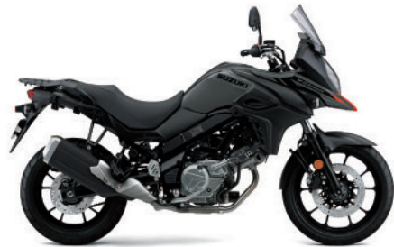
Solid Iron Gray (YUD)