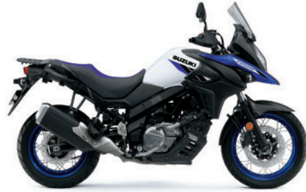
Pearl Vigor Blue / Pearl Brilliant White (JWN)