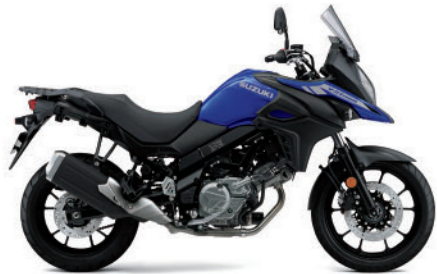
Pearl Vigor Blue (YKY)