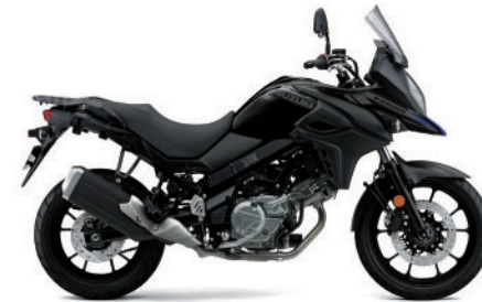
Glass Sparkle Black (YVB)