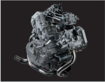
Sophisticated V-Twin Performance

A compact Anti-lock Brake System (ABS)** monitors wheel speed to