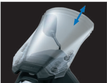
Three-way adjustable windscreen