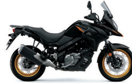
Glass Sparkle Black (YVB)