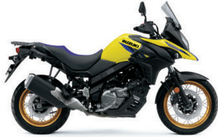
Champion Yellow No.2 (YU1)