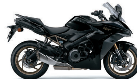
Glass Sparkle Black (YVB)