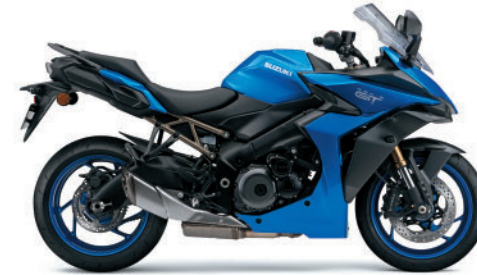
Metallic Triton Blue (YSF)