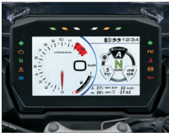
6.5-inch Full-color TFT Display