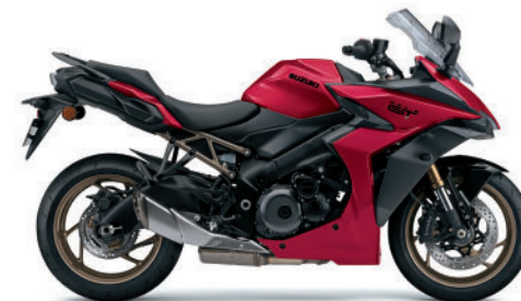
Candy Daring Red (YYG)