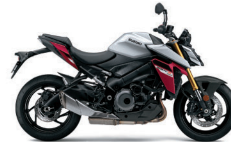
Metallic Mat Sword Silver (QKA)