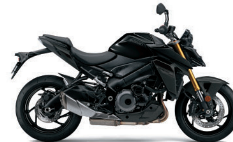
Glass Sparkle Black (YVB)