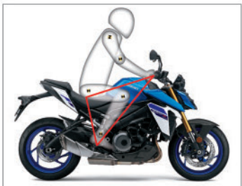
Comfortable Upright Riding Position