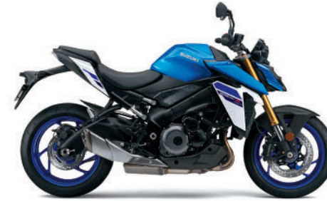
Metallic Triton Blue (YSF)