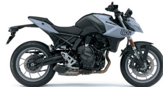
Glass Mat Mechanical Gray (QT7)