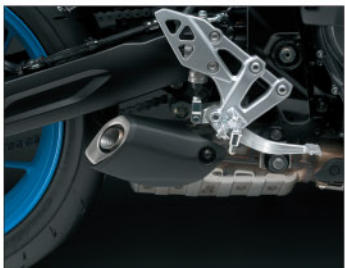
Short Muffler Design