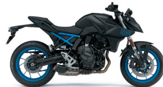
Metallic Mat Black No.2 (YKV)