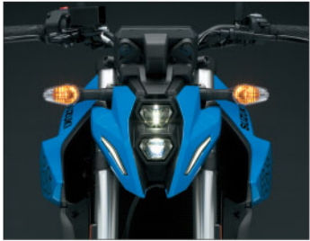
LED Headlights and Position Lights

Delivers the sharpest throttle response as you open the throttle. Torque characteristics are finely tuned to deliver exciting