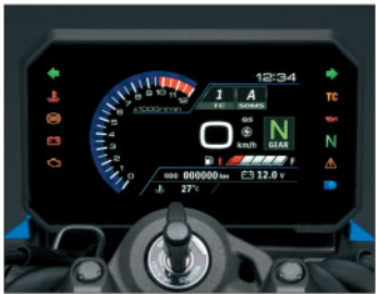
Color TFT Multi-information Display