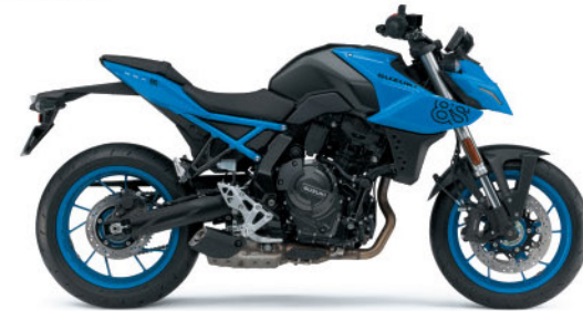
Pearl Cosmic Blue (QU1)