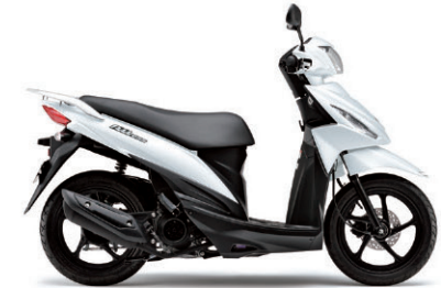
Pearl Brilliant White (YUH)