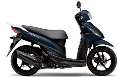
Metallic Mat Stellar Blue (YUA)