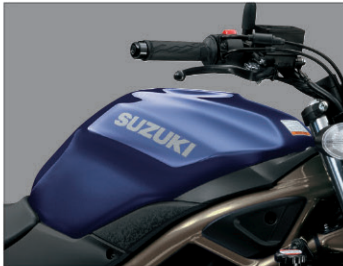
14.5-litre capacity fuel tank