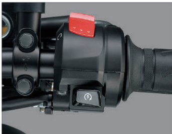
Suzuki Easy Start System