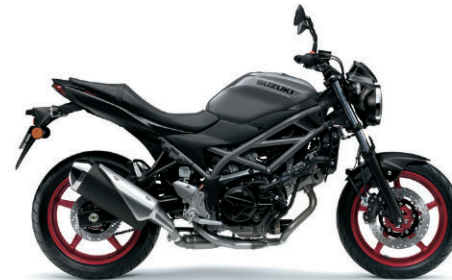
Glass Sparkle Black / Solid Iron Gray (BTH)