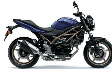
Metallic Reflective Blue (QT8)