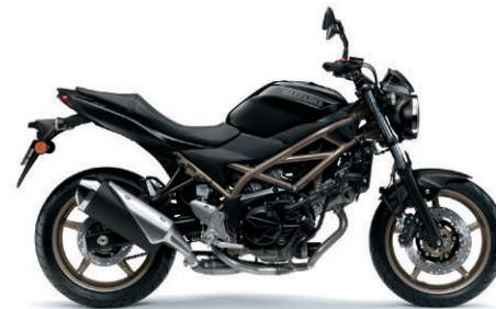
Glass Sparkle Black (YVB)