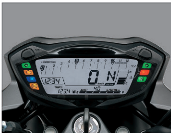
Multi-Function, Full LCD Instrument Cluster