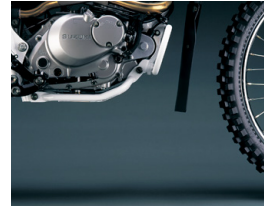
260mm ground clearance