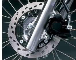
Powerful front disc brake