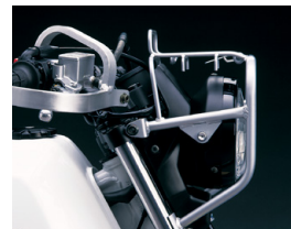
Large headlight and front carrier