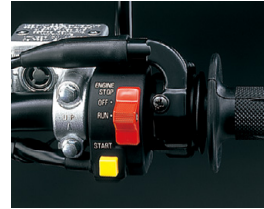
Electric & kick start